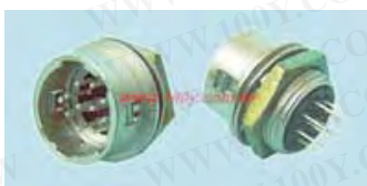
HR10A-10R-10PB / HR10A-10R-12P