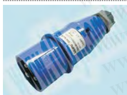
TYP231 / TYP281