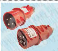
TYP233 / TYP285