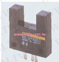
EE-SX470 / EE-SX471