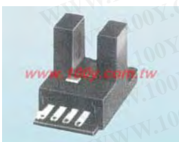
EE-SX674 / EE-SX674A