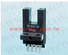
EE-SX473 / EE-SX673 EE-SX673A / EE-SX673P