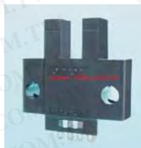
EE-SX670 / EE-SX670A