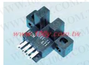
EE-SX671 / EE-SX671A / EE-SX671R