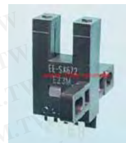
EE-SX672 / EE-SX672A EE-SX672P / EE-SX672R