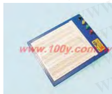
GL-24 / GL-36