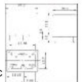
1 From C