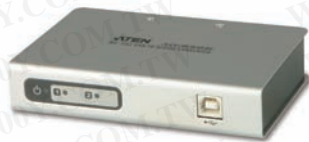
UC2322 2-Port USB-to-Serial RS-232 Hub