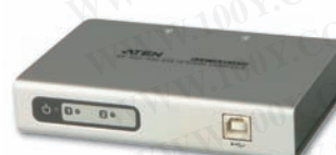
UC4852 2-Port USB-to-Serial RS-422/485 Hub