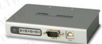
UC4854 4-Port USB-to-Serial RS-422/485 Hub