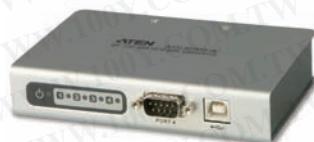
UC2324 4-Port USB-to-Serial RS-232 Hub