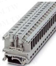
Universal terminal block with bolt connection, cross section: 0.1 - 2.5 mm 2 , width: 9 mm, color: Gray

Please be informed that the data shown in this PDF Document is generated from our Online Catalog. Please find the complete data in the user's documentation. Our General Terms of Use for Downloads are valid ( http://download.phoenixcontact.com )