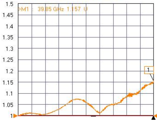
Tr1 S11 Refl SWR RefLvl: 1 U Res: 50 mU/Div