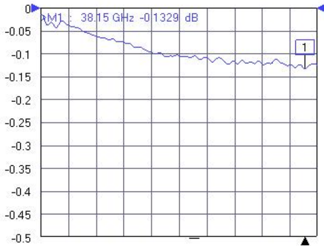
Tr3 S21 Trans LogM RefLvl: 0 dB Res: 0.05 dB/Div