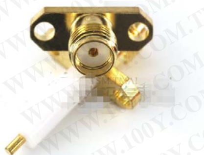
绝缘体长12MM 铜体长3MM SMA-KFD12-3 外螺内孔 2孔法兰