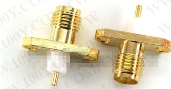
绝缘体长4MM 铜体长3MM SMA-KFD4-3 外螺内孔 2孔菱形