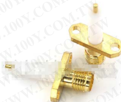
绝缘体长12MM 铜体长3MM SMA-KFD12-3 外螺内孔 2孔法兰