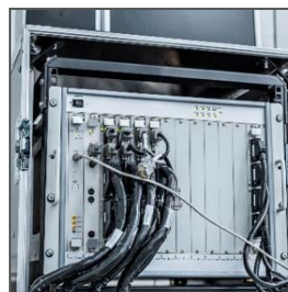
Control panel on test equipment