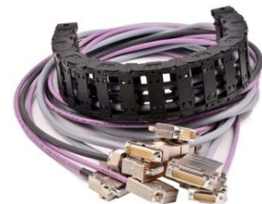
Examples of metal backshell applications