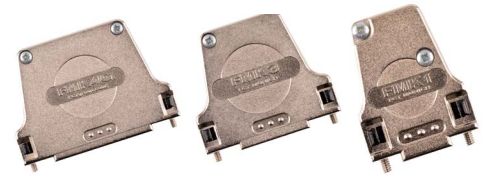
Metal Backshells for D-Sub Connectors

Metal Backshells for D-Sub Connectors are available with either straight or angled cable outlets and provide connector protection, strain relief and organized cable routing