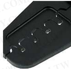
Made of thin dies for small-sized contact pins