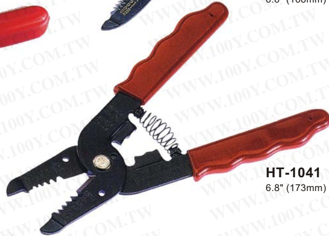
HT-1041 6.8" (173mm)