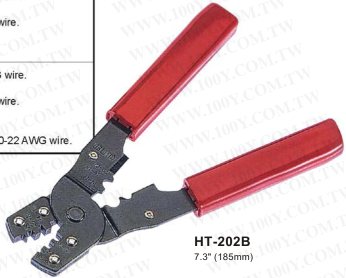
HT-202B 7.3" (185mm)