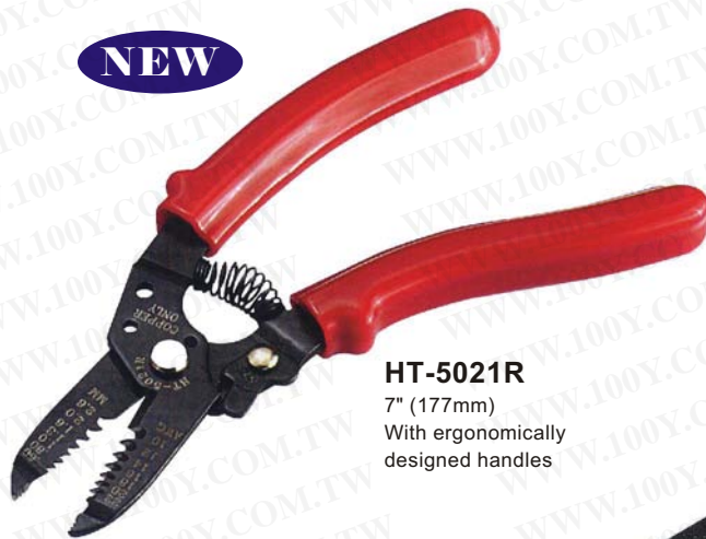
HT-5021R 7" (177mm) With ergonomically designed handles