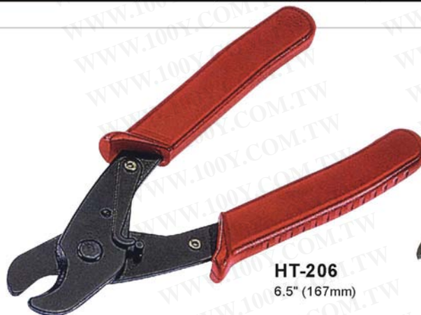
HT-206 6.5" (167mm)