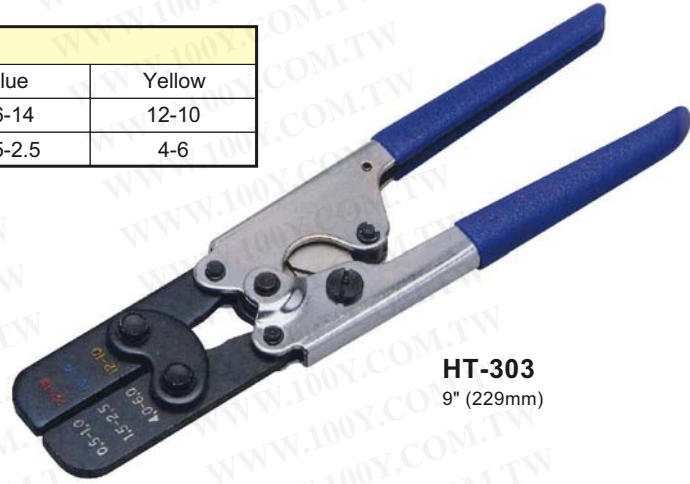
HT-303 9" (229mm)