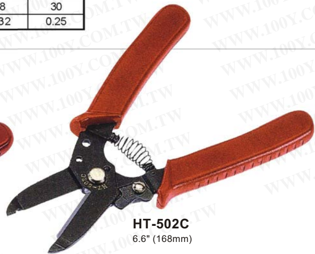
HT-502C 6.6" (168mm)