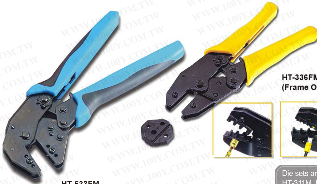
HT-533FM (Frame Only) 9.4" (239mm)