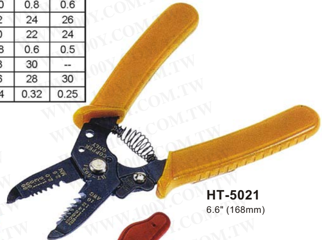
HT-5021 6.6" (168mm)