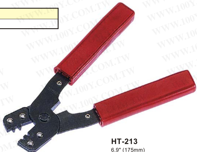
HT-213 6.9" (175mm)