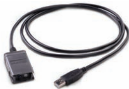
U5481A IR-to-USB cable