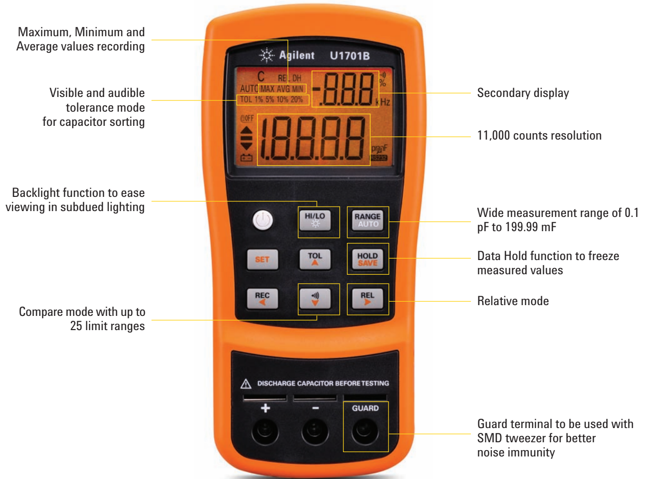
Figure 2: U1701B front view