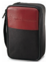
U1174A Soft carrying case