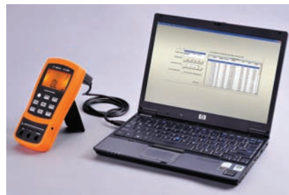
Figure 1: Automate the recording of continuous readings when you hook the U1701A/U1701B to a PC