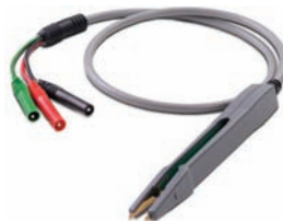
U1782A SMD tweezer