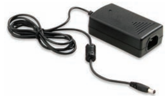
U1780A Power adapter and cord (according to country)