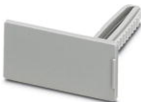
Terminal strip marker carrier, height-adjustable, for end brackets CLIPFIX 15, CLIPFIX 35 and CLIPFIX 35-5, can be labeled with BMK...20 x 8 labels, or directly with the M-PEN or X-PEN

Please be informed that the data shown in this PDF Document is generated from our Online Catalog. Please find the complete data in the user's documentation. Our General Terms of Use for Downloads are valid ( http://download.phoenixcontact.com )