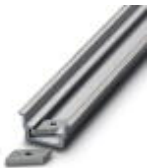
DIN rail, deep drawn, high profile, unperforated, 1.5 mm thick, material: aluminum, height 15 mm, width 35 mm, length 2000 mm

DIN rail, unperforated - NS 35/15 AL UNPERF 2000MM - 1201756