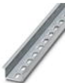
DIN rail, material: Galvanized, perforated, height 15 mm, width 35 mm, length: 2 m

DIN rail - NS 35/15 ZN PERF 2000MM - 1206599