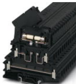
The figure shows a version of the article

Please be informed that the data shown in this PDF Document is generated from our Online Catalog. Please find the complete data in the user's documentation. Our General Terms of Use for Downloads are valid ( http://download.phoenixcontact.com )