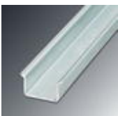
DIN rail, material: Galvanized, unperforated, height 15 mm, width 35 mm, length: 2 m

DIN rail - NS 35/15 ZN UNPERF 2000MM - 1206586