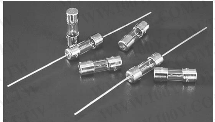
225 000P Series