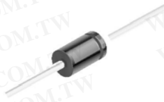
DO-41 Glass case COLOR BAND DENOTES CATHODE