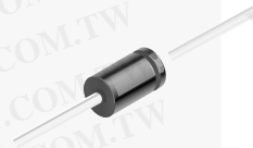
DO-35 Glass case COLOR BAND DENOTES CATHODE