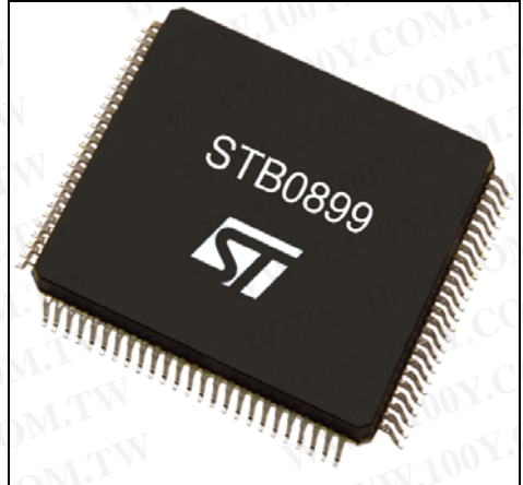
Figure 1. STB0899 DVB-S2 set-top box