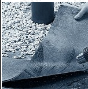
Welding roofing felt

勝特力材料 886-3-5753170 勝特力电子(上海) 86-21-54151736 勝特力电子(深圳) 86-755-83298787 Http://www.100y.com.tw