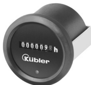
Timer, round Type HR 47