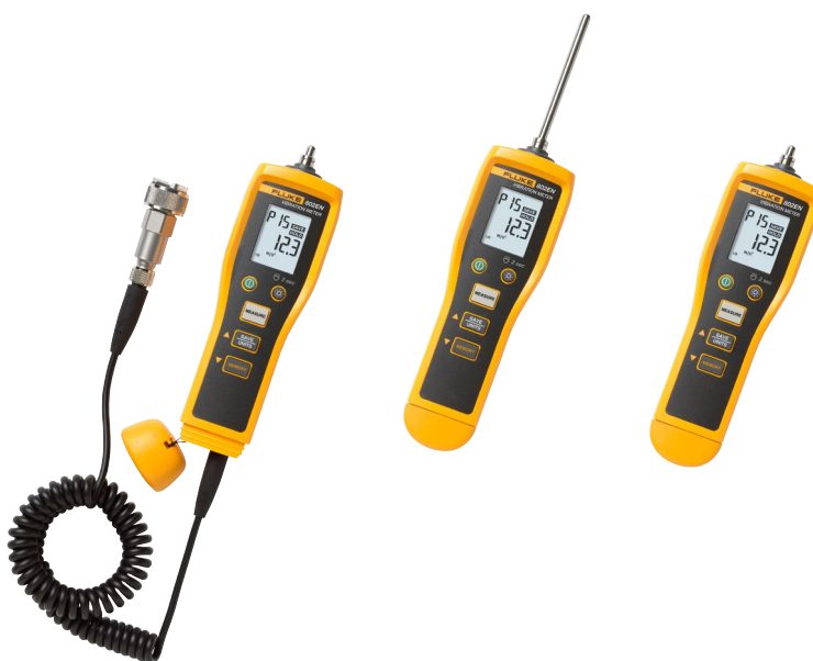
Extension Rod Mode

The Fluke 802EN Vibration Meter reaches the highest standard of repeatability and accuracy. It quickly checks a wide range of mechanical equipment in factories by measuring displacement, velocity, and acceleration. Moreover, the 802EN is easy to use, efficient and fast making it an excellent for diagnostic tool for use in Food and Beverage Processing, manufacturing and production, power plants and petrochemical industries.