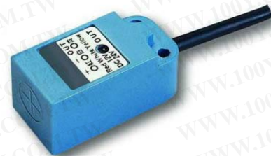
PX-01 ( Optional )

勝特力材料 886-3-5753170 勝特力电子(上海) 86-21-34970699 勝特力电子(深圳) 86-755-83298787 Http://www.100y.com.tw