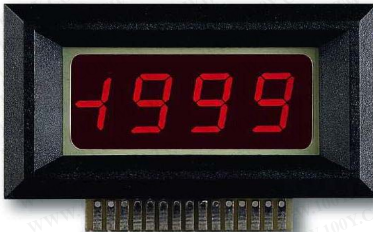
LED display with mounting bezel, Model : DP-40