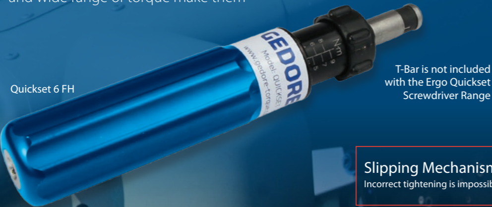
Quickset 6 FH

Quickset Adjustable Torque Screwdrivers are calibrated scale tools that can be used for the accurate and consistent application of torque in any manufacturing, engineering or servicing environment. Their adjustability and wide range of torque make them suitable for a broad range of applications. These tools are durable, easy to use and the unique Slipping Technology means that the risk of over or under tightening is eliminated.