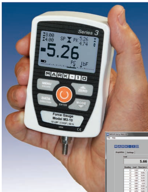
MESUR® Lite data acquisition software is included with Series 3 gauges