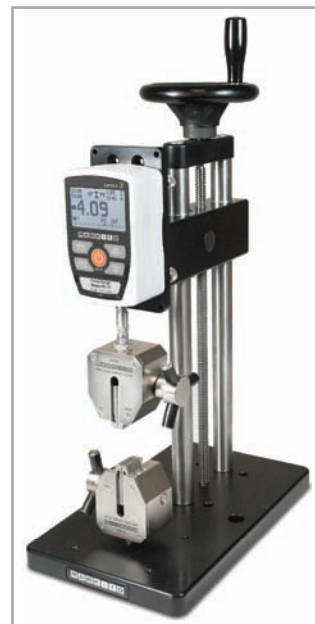
Shown with an ES20 test stand and G1061 wedge grips

Series 3 gauges include MESUR® Lite data acquisition software, for tabulation of continuous or individual data points. One-click export to Excel button easily allows for further data manipulation.