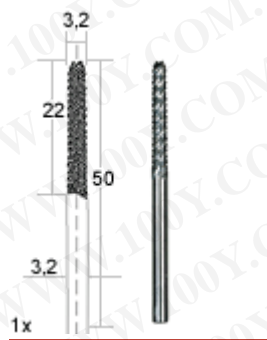
NO 28 757

Made of wear-resistant highly compressed fine-granular tungsten. Used for vibration-free milling of high accuracy dimensions. It is advisable to secure workpieces well, avoiding accidents. For milling steel, cast steel, non-ferrous metals, plastics and extremely hard materials. May be used for technical work, for engraving and milling of PC cards. Shafts \varnothing 3.0 or 2.35mm.