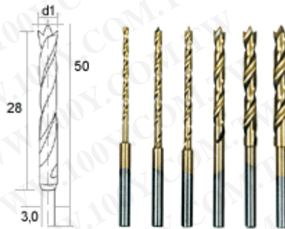
NO 28 876

One each of 0.3 - 0.5 - 0.8 - 1.0 - 1.2 - 1.5 - 2.0 - 2.5 - 3.0 - 3.2mm diameter. For drilling non-ferrous metals, steel, high-quality steel. 10 pieces.