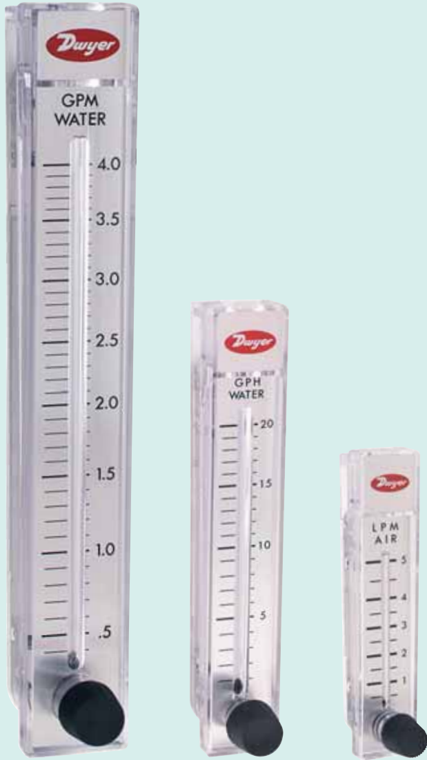
Model RMC-SSV 10" scale, 15-3/8" high