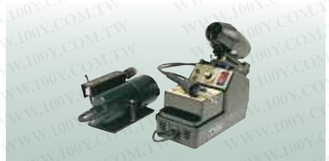
TYPICAL SET-UP VS174 ATMOSCOPE vacuum generator with 971FX