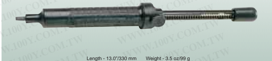
Length - 13.0"/330 mm Weight - 3.5 oz/99 g