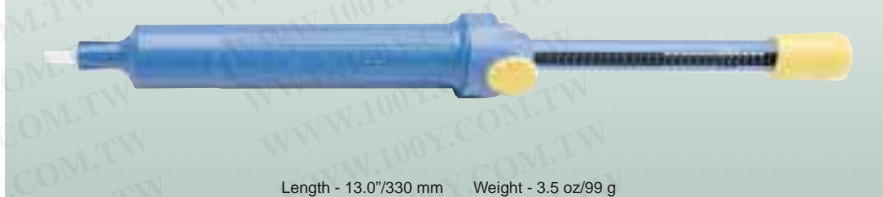
Length - 13.0"/330 mm Weight - 3.5 oz/99 g