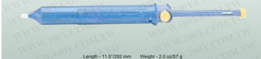
Length - 11.5"/292 mm Weight - 2.0 oz/57 g