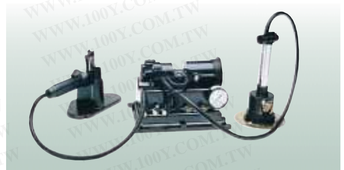
TYPICAL SET-UP VP171 ATMOSCOPE vacuum generator with DS317 and ZD100