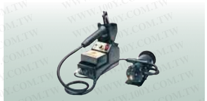
TYPICAL SET-UP VS171A ATMOSCOPE vacuum generator with ZD505