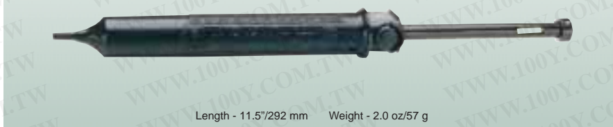
Length - 11.5"/292 mm Weight - 2.0 oz/57 g