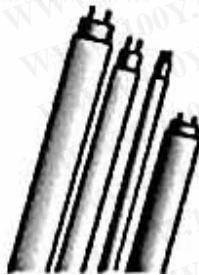
typical photo of F4T5/650 bulb type (your bulb may look slightly different)

勝特力材料 886-3-5753170 勝特力电子(上海) 86-21-54151736 勝特力电子(深圳) 86-755-83298787 Http://www.100y.com.tw