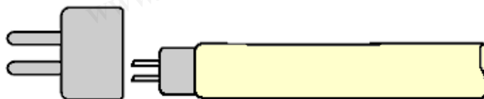
G5 Miniature Bipin