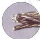
Using by conventional tool

Designed for wire cutting purpose. Easy cutting by one-hand operation.