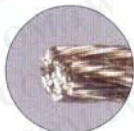
Using by wire clipper