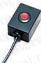
No.B2763 Hand Switch