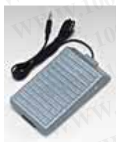
No.1649 Foot Switch