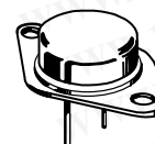
CASE 1-07 TO-204AA (TO-3)

20 AMPERE POWER TRANSISTORS COMPLEMENTARY SILICON 140 VOLTS 250 WATTS