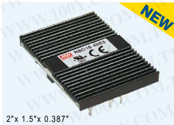
2" x 1.5" x 0.387"