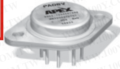
8-pin TO-3 PACKAGE STYLE CE