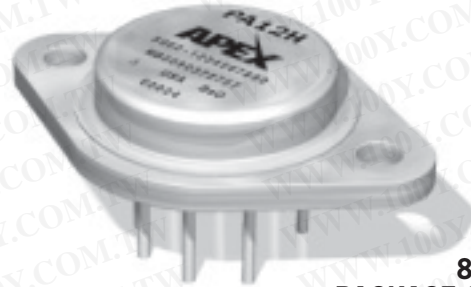
8-pin TO-3 PACKAGE STYLE CE

These hybrid integrated circuits utilize thick film conductors, ceramic capacitors and silicon semiconductors to maximize reliability, minimize size and give top performance. Ultrasonically bonded aluminum wires provide reliable interconnections at all operating temperatures. The 8-pin TO-3 package (see Package Outlines) is hermetically sealed and isolated. The use of compressible thermal washers and/or improper mounting torque will void the product warranty. Please see "General Operating Considerations".