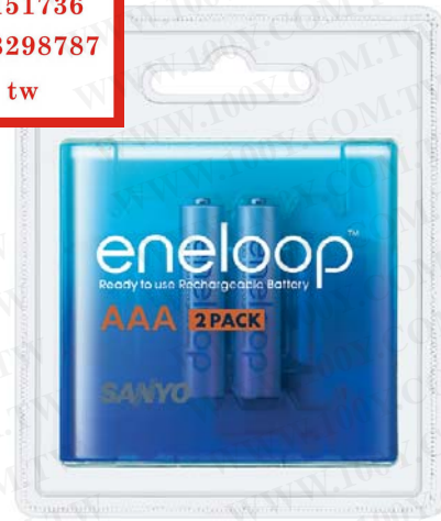
HR-3UTG-2BP-SP eneloop 低自放電三號鎳氫充電電池 容量：2000mAh