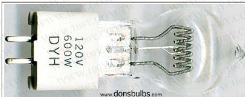
typical photo of DYH ANSI bulb type (your bulb may look slightly different)