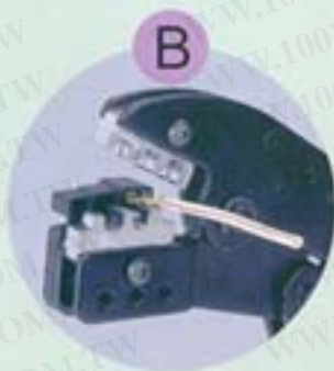
Individual Replaceable Positioner

勝特力材料 886-3-5753170 勝特力电子(上海) 86-21-54151736 勝特力电子(深圳) 86-755-83298787 Http://www.100y.com.tw