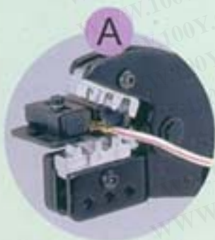
Universal Adjustable Positioner